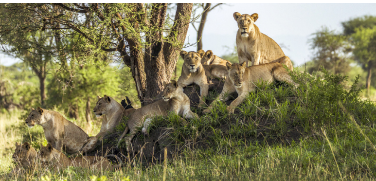
Resident Lion Prides