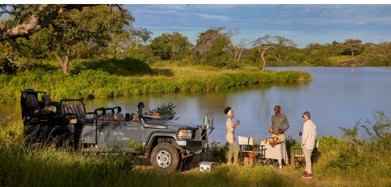
Private Guide & Vehicle